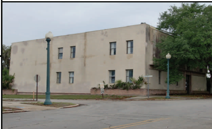
Existing Building at 301 Central Ave