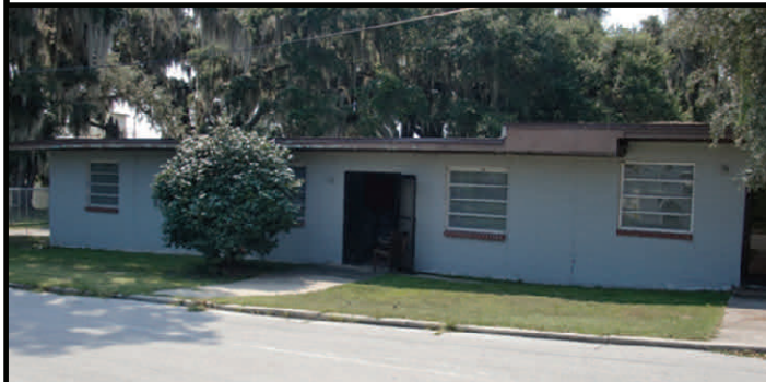
Existing Building at 105 Cypress Ave

What are your thoughts on these options? Contact City Hall or your City Commissioner and let them know what you think.